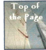
Top of the Page

Sailboats Florida a division of Yacht Sales Florida, LLC Harborage Marina at Bayboro - 1110 Third Street South St Petersburg, Florida 33701 Office - 727.553.9551 Fax - 727.896.5175 email: sales@sailboatsflorida.com